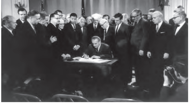
The Fair Housing Act was signed by President Lyndon B. Johnson on April 11, 1968, as an amendment to the Civil Rights Act of 1964 (Title VIII)

Home Owners’ Loan Corporation (HOLC) instituted a redlining policy by developing color-coded maps of American cities using racial criteria to