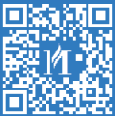
EXHIBIT NOW ON VIEW

Girlhood (It's complicated) explores the concept of girlhood in the United States and highlights the many ways young women have influenced politics, education, work, health, and fashion.